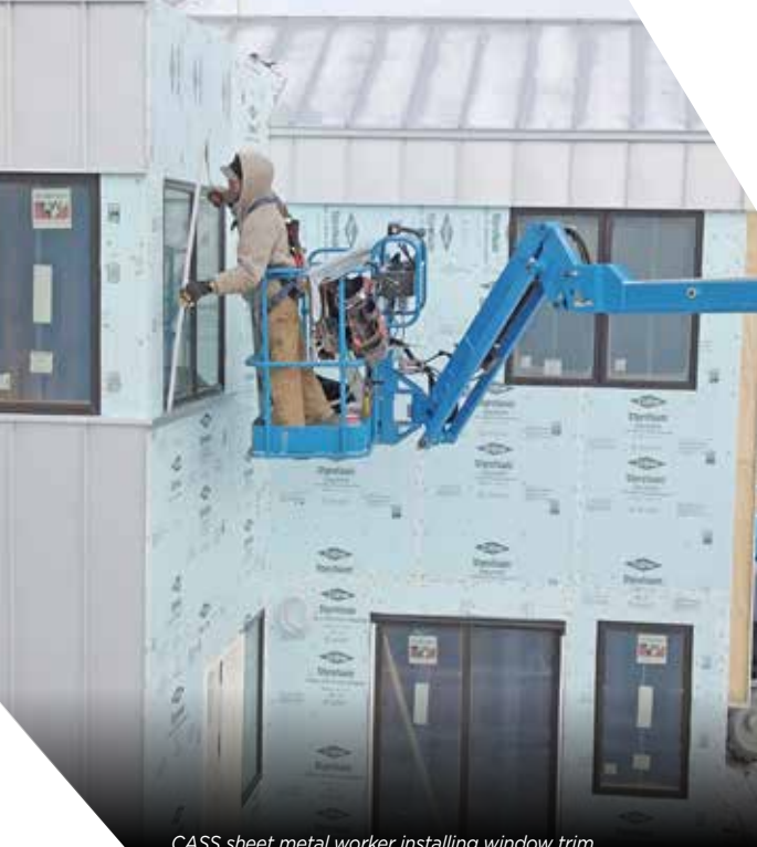
CASS sheet metal worker installing window trim.

His team will spend roughly 4,500 man-hours on the midtown neighborhood project. Nine of the 14 houses have already been sold, with move-ins starting in April and